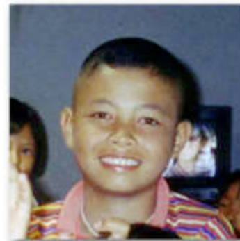
Here's one boy that's looking forward to having a family.

NEW Serving Our World website coming soon!